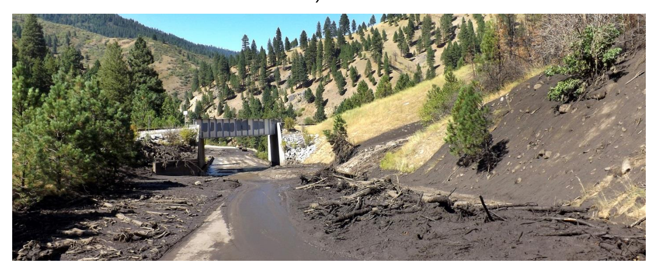
An integrated approach to protecting the public's investment in Idaho's transportation system